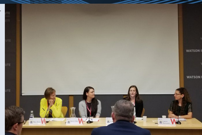
U. S. Naval War College photo from the 6th Annual Women, Peace and Security Conference in partnership with Brown University's A. Taubman Center for American Politics and Policy, May 31 to June 1, at Brown's Watson Institute for International and Public Affairs.

Highlights of the course included a Korean Women's NGO called Women Cross DMZ, which gave a moving presentation on how DoD can support and facilitate their efforts to include a 2015 march where women from North and South Korea were able to cross the DMZ. The course also featured the unique Indo-Pacific civil picture to target the participants who work