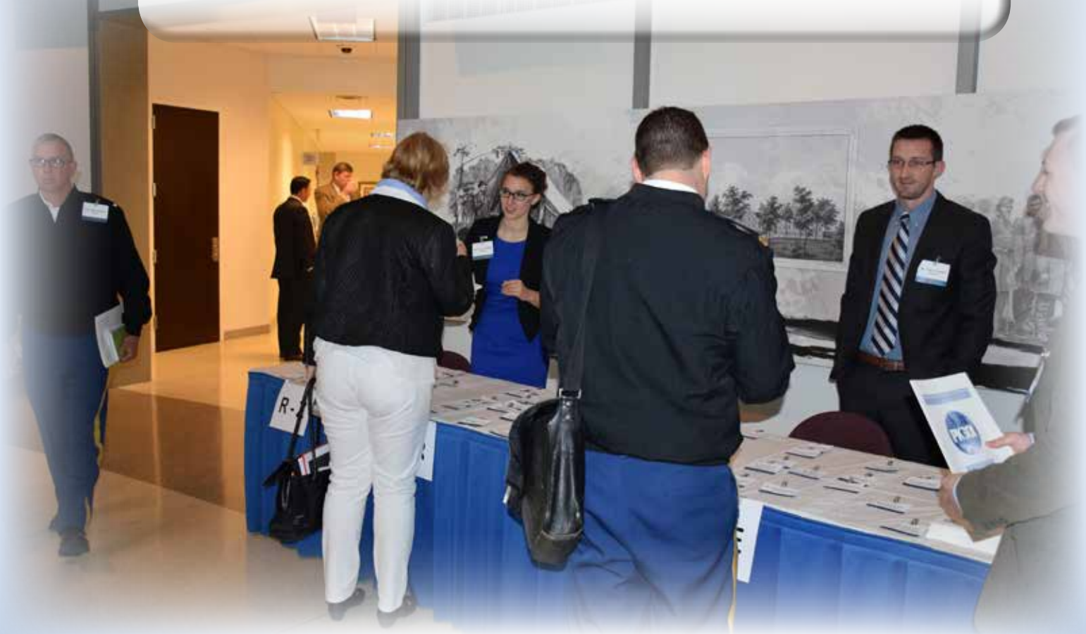
PSOTEW Day 1, PKSOI Interns working the registration table at NDU

During the last eight years, the (PSOTEW) has provided a forum in which educators and trainers can dialogue on essential content, methods and practices in the areas of conflict response/prevention and peacebuilding programs. The PSOTEW has afforded educators, trainers and practitioners with a platform to collaborate on the development and presentation of integrated, cross-organizational curricula and programs that advance leader development, education, and training across the community of interest. Building upon the previous year's discussions on